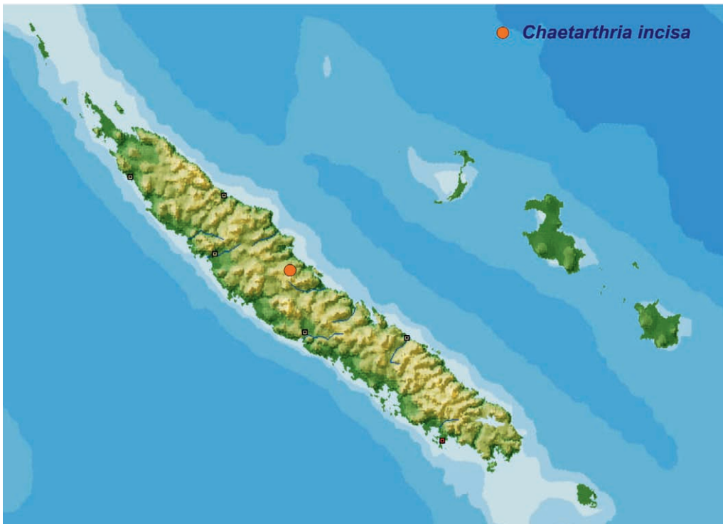
Fig. 7: Geographical distribution of Chaetarthria incisa .

ETYMOLOGY: The name refers to the laterally incised pronotum.