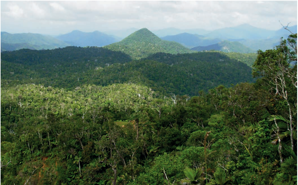
Fig. 6: New Caledonia, Aoupinié. The type locality of Chaetarthria incisa is situated on the left, not seen on this photograph.

DIAGNOSIS: This species is easily distinguishable from all other Oriental and Australian Chaetarthria by the concave lateral margins of the pronotum (Fig. 2). In contrast, the anterolateral pronotal angles are inconspicuous in the C. indica species group (Fig. 3), or the anterolateral angle is less projecting anteriorly and the lateral pronotal margins are convex in C. saundersi ORCHYMONT, 1923 and C. nigerrima (Figs. 4–5). The morphology of the aedeagus (Fig. 1) is very distinct from the species of the C. indica group: phallobase rather short, with minute manubrium; parameres of different shape; median lobe narrow, lacking apical emargination or flagellum. Chaetarthria incisa differs from C. saundersi and C. nigerrima in the narrow, apically parallel-sided aedeagal median lobe and by the corona, which is situated far from the apex of the median lobe (the median lobe is widely rounded apically in C. saundersi and continually narrowing from base to apex in C. nigerrima ; the corona is situated subapically in the two latter species).